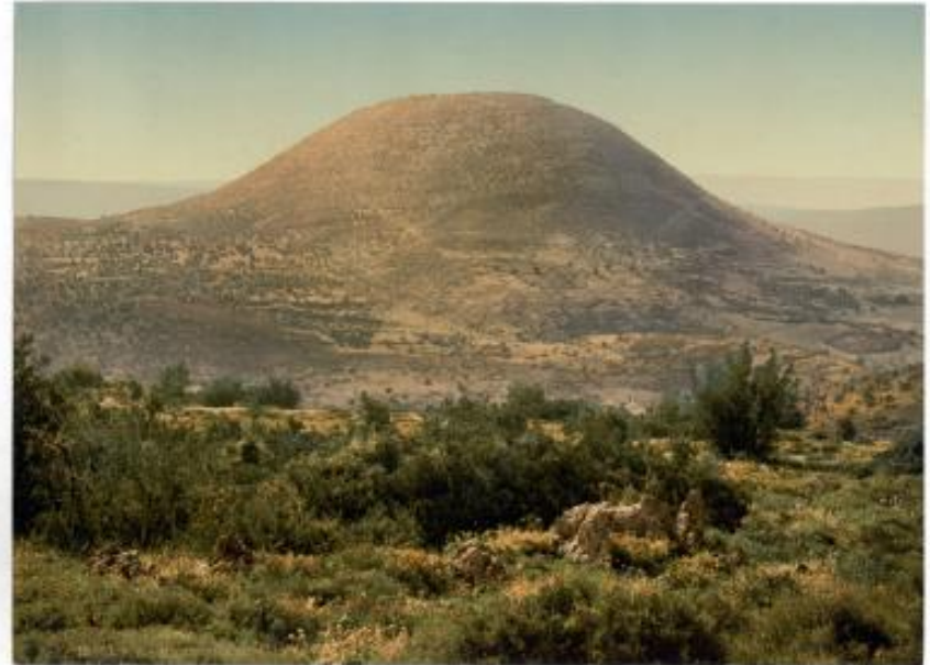
Mount Tabor, Galilee