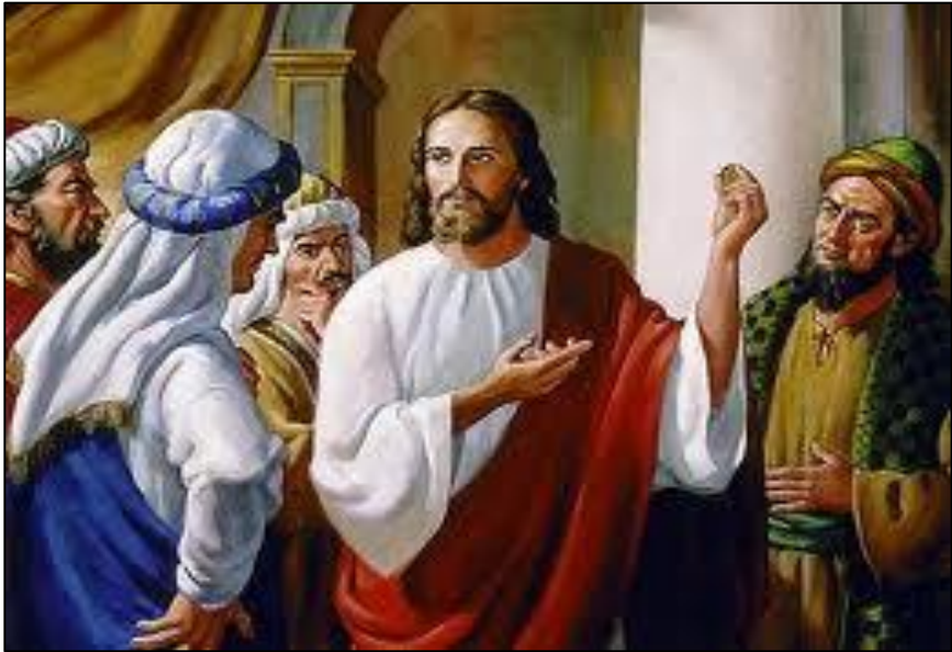
John 8 : 58