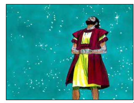
Jacob -> Israel