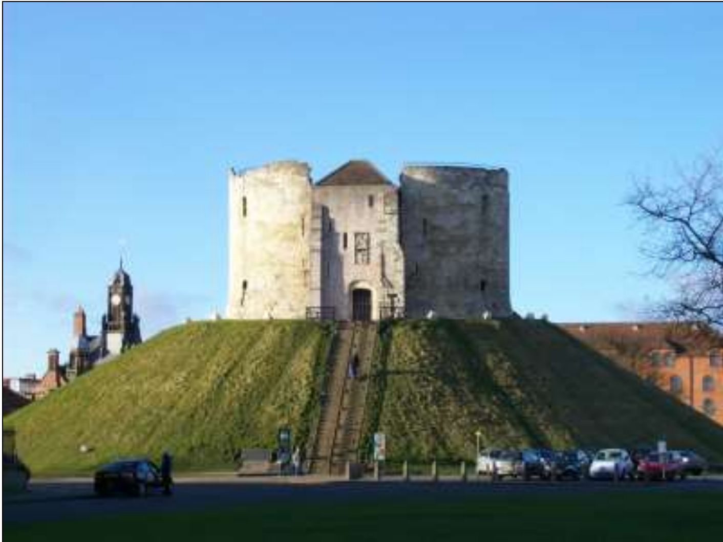
York - Clifford's tower